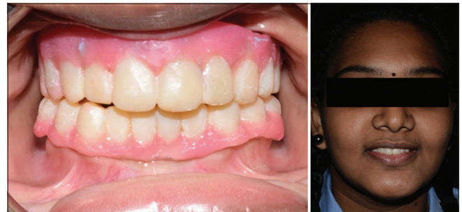
Figure 5: Trial denture made with the thermoplastic template