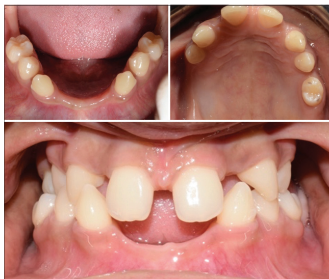
Figure 2: Intraoral view of the maxilla and mandible and the occlusion