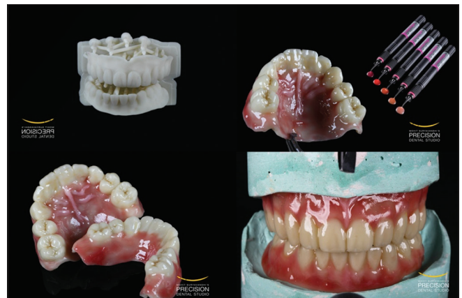
Figure 7: Characterization of the three-dimensional printed denture with Visio.lign system