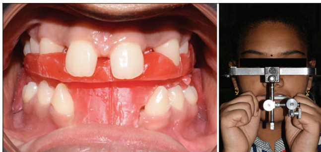
Figure 4: Jaw relation record of the patient and face bow transfer recorded

The advantage of this prosthesis is the increased fracture resistance when compared to conventional overlay denture even though it is lighter in weight. The newer materials available allow for better characterization of the denture.