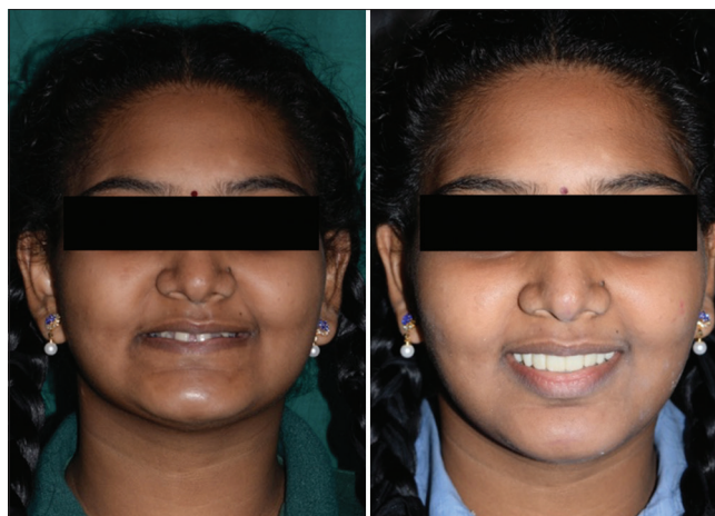
Figure 9: Comparison of the pre and postoperative views

The authors certify that they have obtained all appropriate patient consent forms. In the form, the legal guardian has given his consent for images and other clinical information to be reported in the journal. The guardian understands that names and initials will not be published and due efforts will be made to conceal identity, but anonymity cannot be guaranteed.