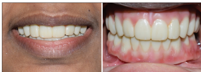
Figure 8: Postoperative smile and occlusion of the patient

In case of any natural tooth movement due to growth spurt, the denture can be easily adjusted. The intaglio surface of the denture can be trimmed to accommodate the movement of teeth and relined with PMMA of suitable shade after blocking the undercuts. [8] Being a digital file, it is also easy to reprint the same denture if required. As it is a removable prosthesis, it will not restrict the growth of the patient.