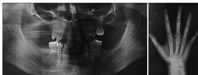
Figure 3: Orthopantomogram and the hand and wrist radiograph of the patient

were blocked, occlusal rims fabricated and centric relation was recorded at the appropriate vertical dimension [Figure 4].